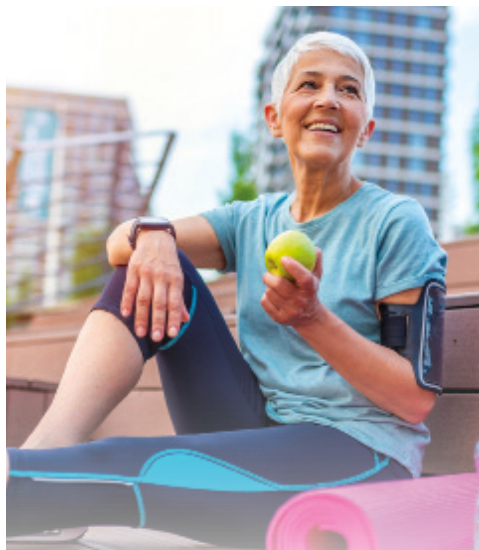
Apples act as a natural, gentle cleanser for your digestive system.

From digestive support to immune health, these crunchy delights show that good health can be as simple as reaching for the fruit bowl!